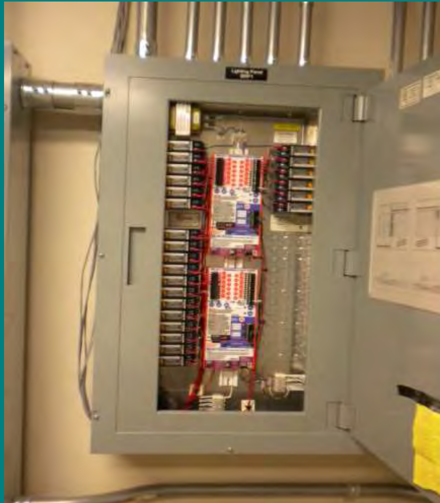
Lighting control panel