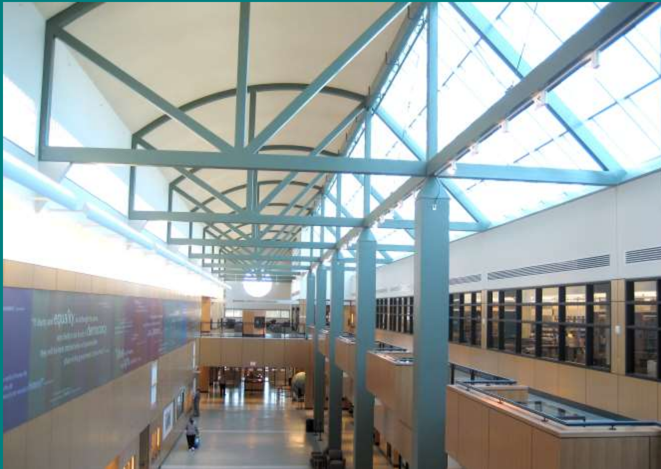
Great Hall – showing natural lighting.