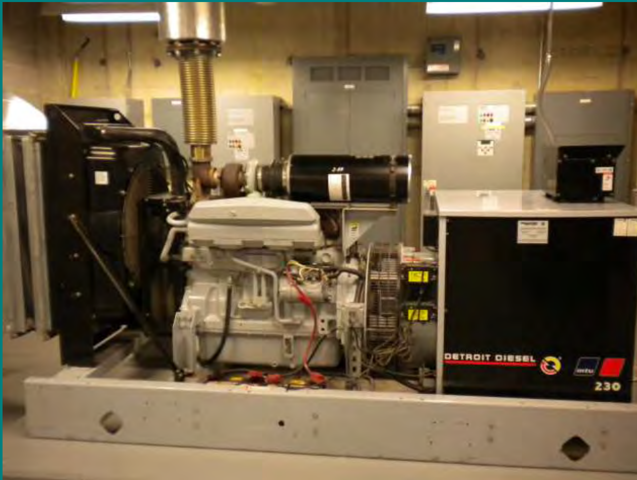
Emergency generator – also used for load shaving to lower KW demand.